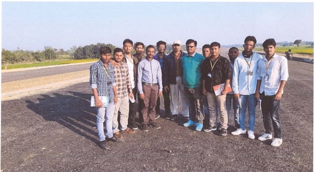
Internship to National Highway Construction at Lucknow