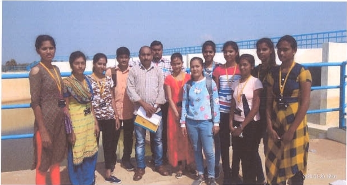
Internship to Chinthalapudi Lift Irrigation System