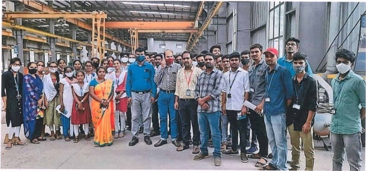
Industrial Visits HYQUIP System at Cherlapally