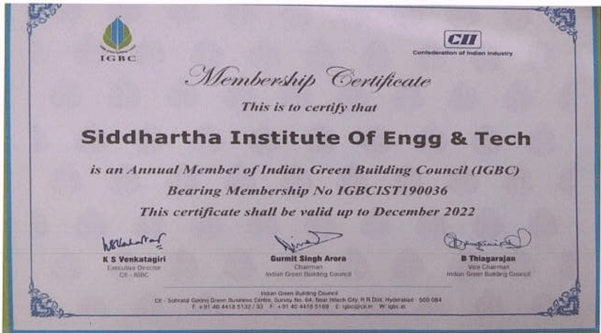
IGBC Membership certificate