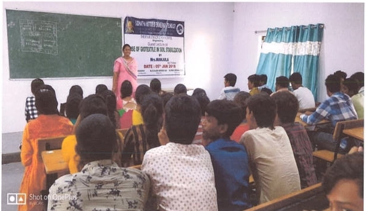
Guest Lecture on Use of Geo-Textile In Soil Stabilization