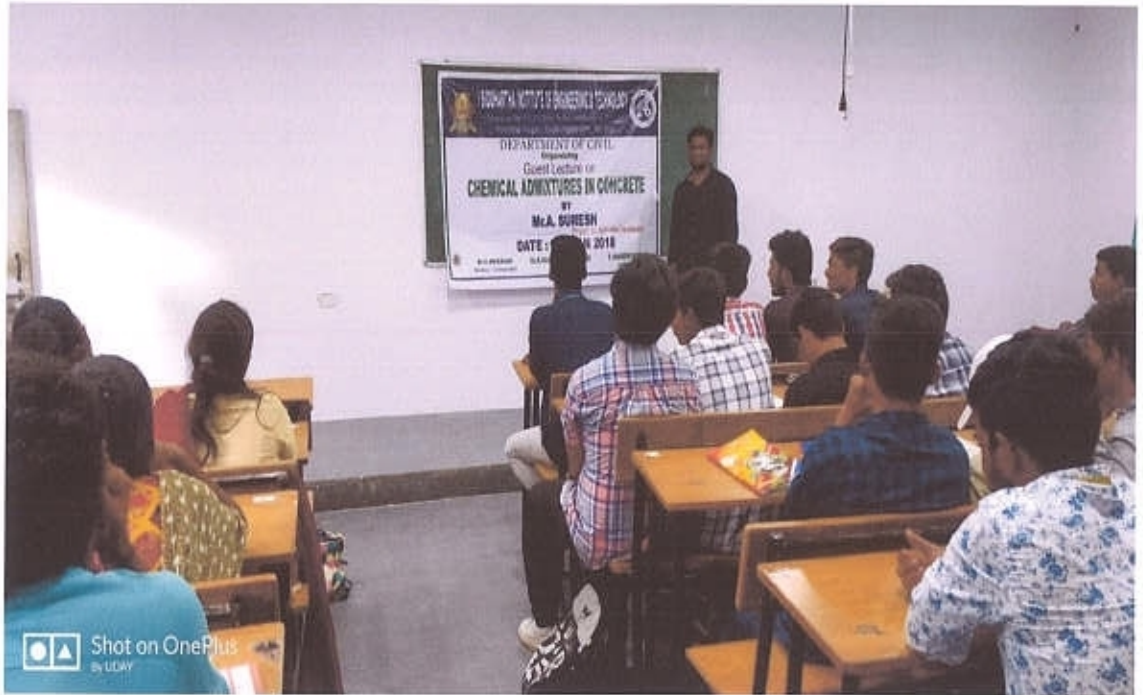
Guest Lecture on Chemical Admixtures in Concrete