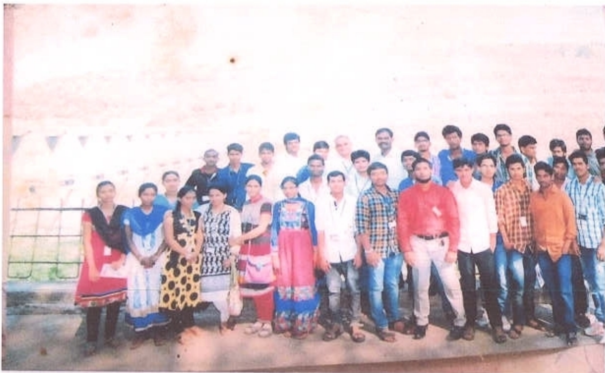
Industrial tour to Srisailem Dam