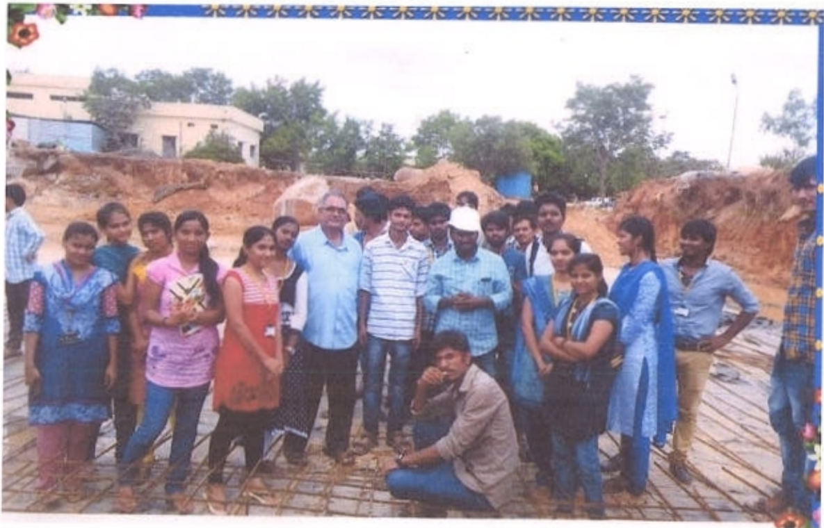
Industrial Visit to Construction of GLSR at Saheb Nagar Reservoir