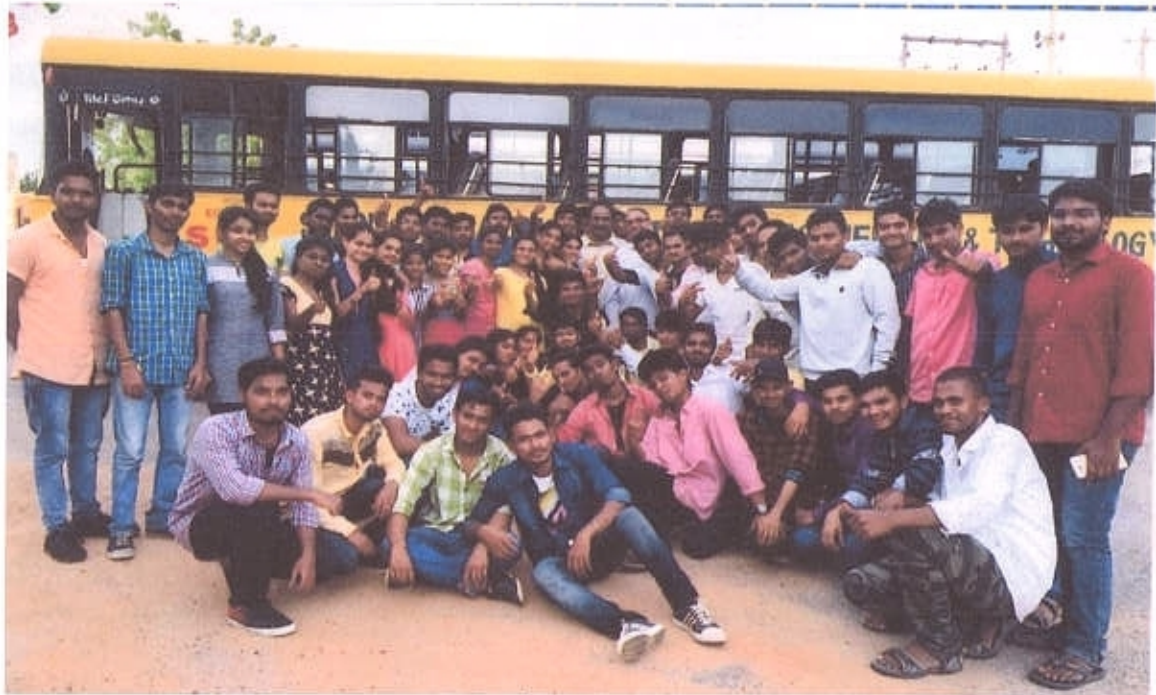
Industrial tour to Nagarjunsagar Dam