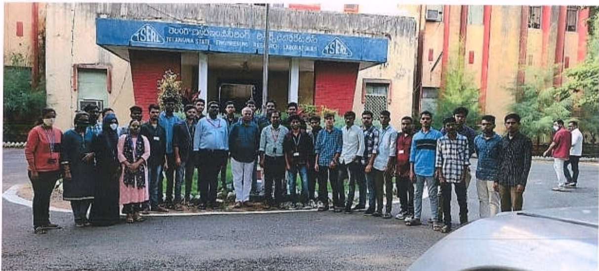
One day Industrial Visit to TSERL