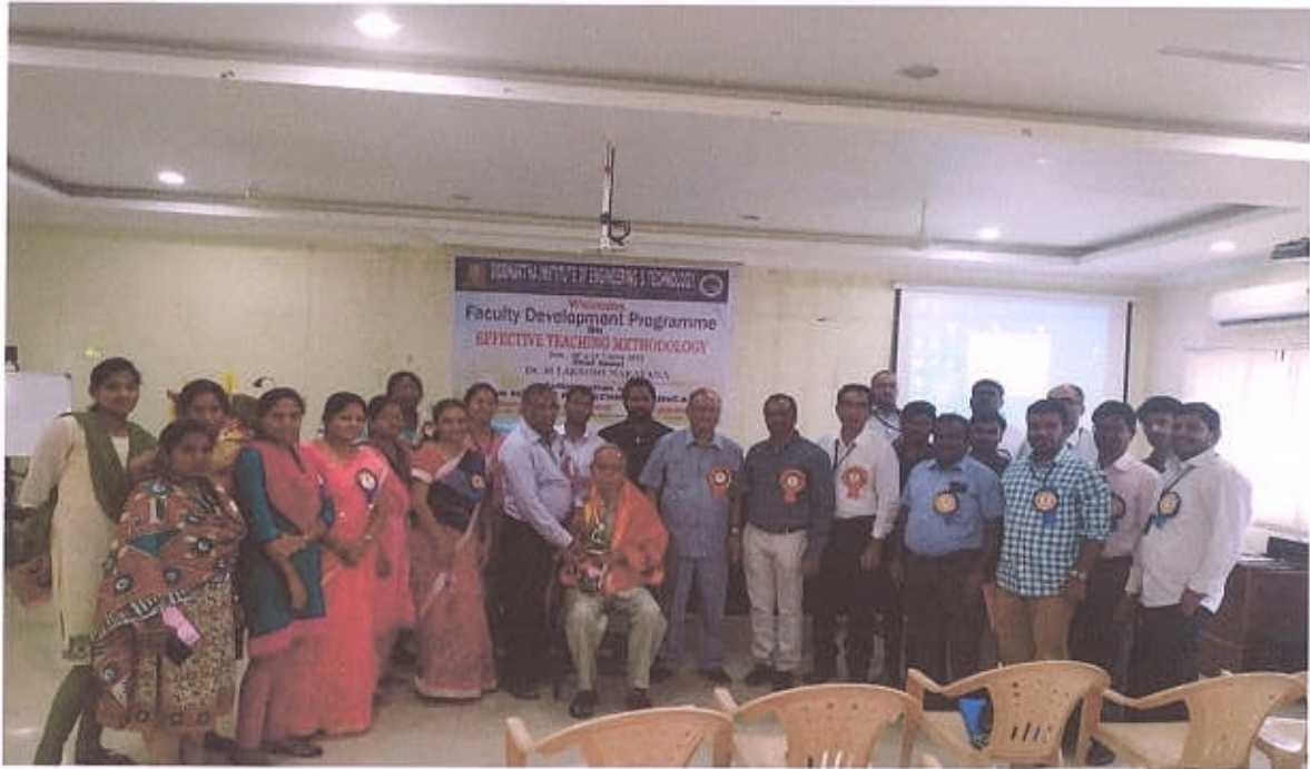
Faculty Development Program on Effective teaching Methodology chief guest felicitation