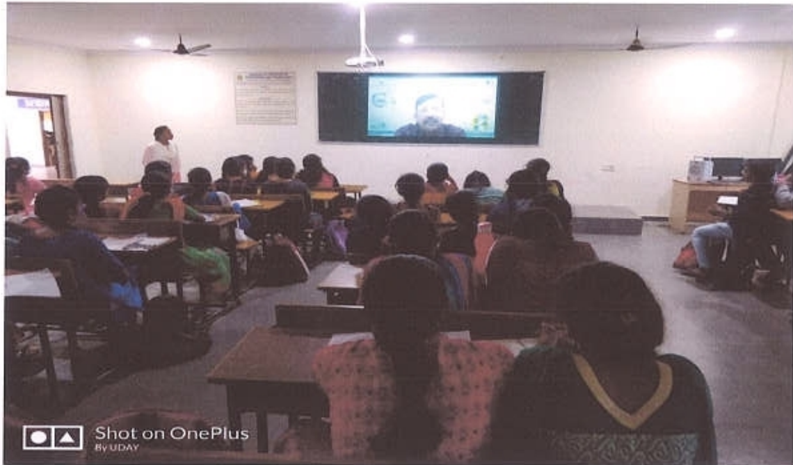
Conducting NPTEL Class