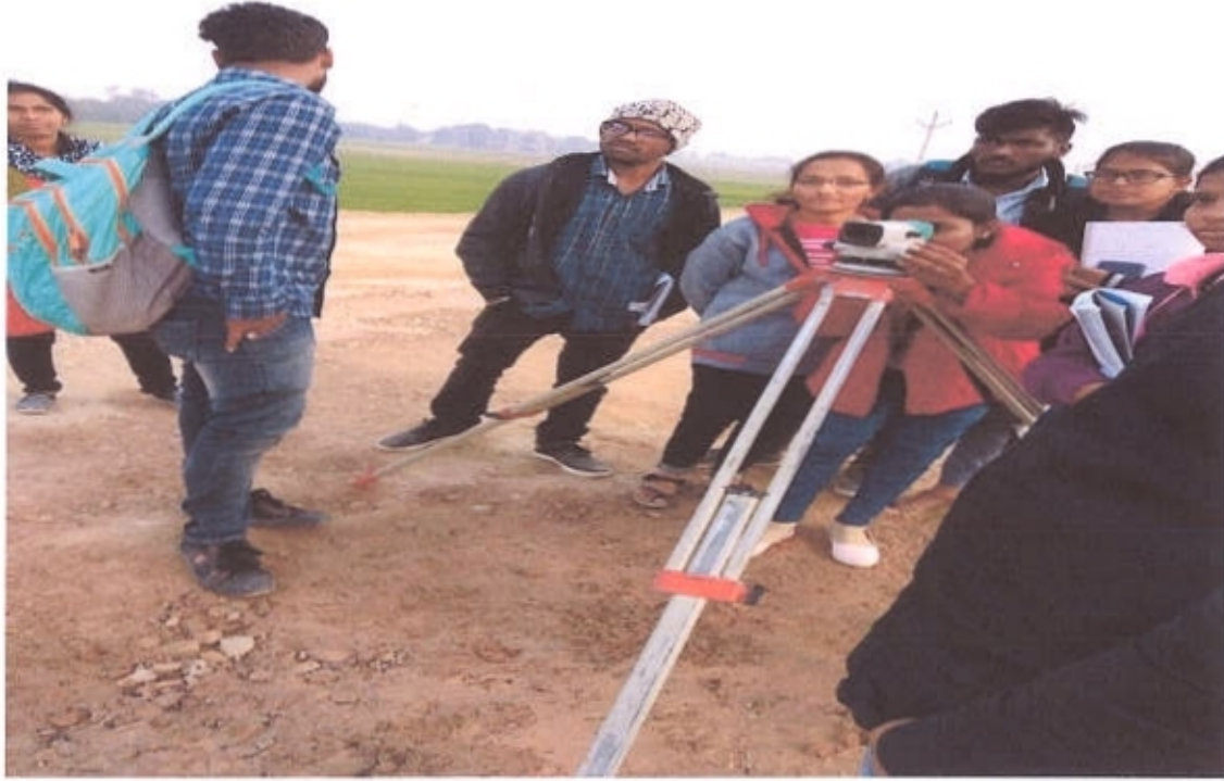
Internship to National Highway Construction at Varanasi