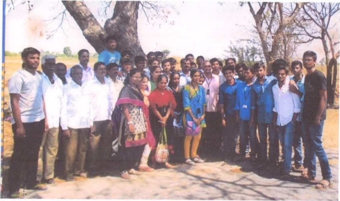
Industrial Visit to Dindi Project