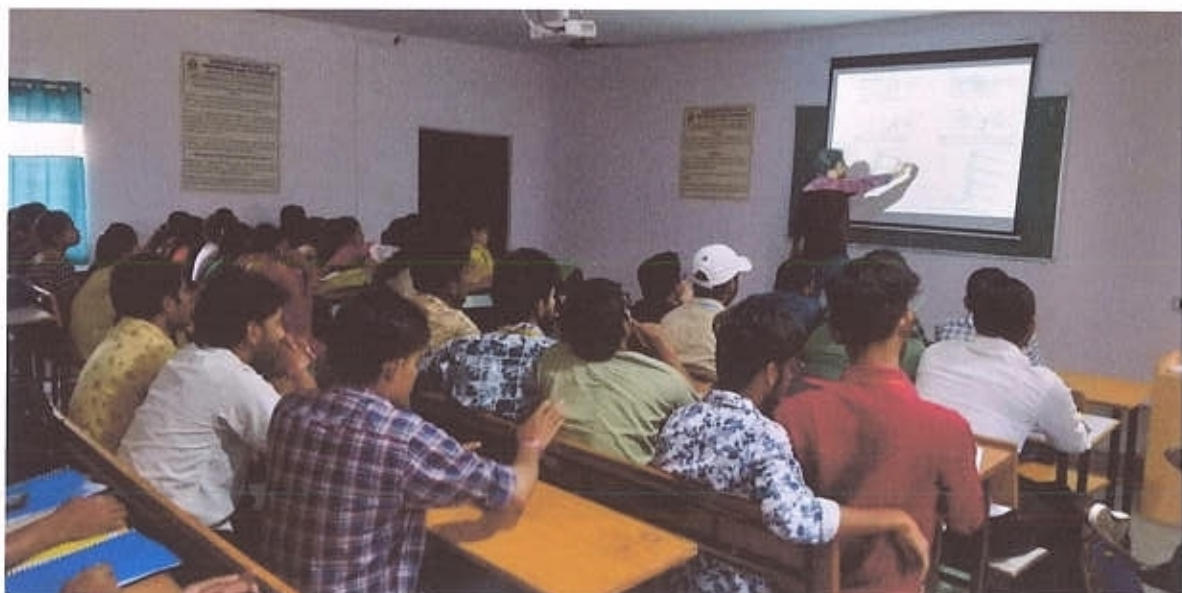
Delivering a Lecture by Using Power Point Presentation