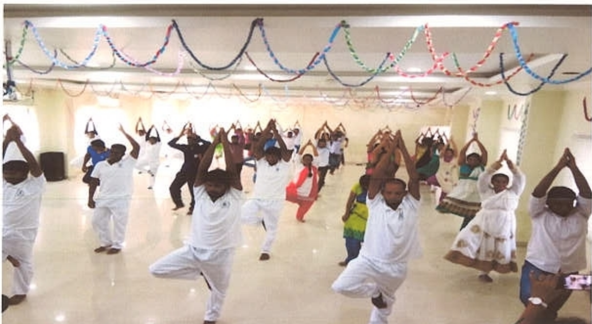
As Yoga is an ancient physical, mental and spiritual practice that originated in India, Siddhartha Institute of Engineering & Technology marked "International Day of Yoga Celebrations" at Siddhartha.