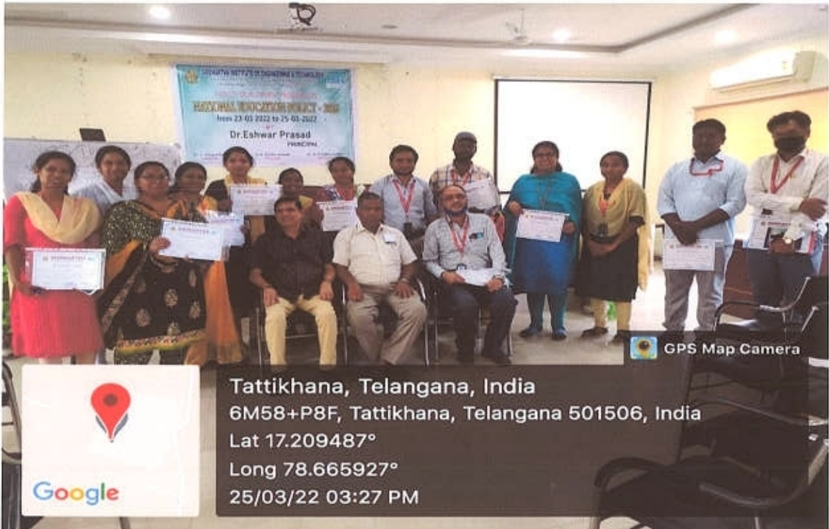
Awarding Certificates after guiding the faculty for development of professional education