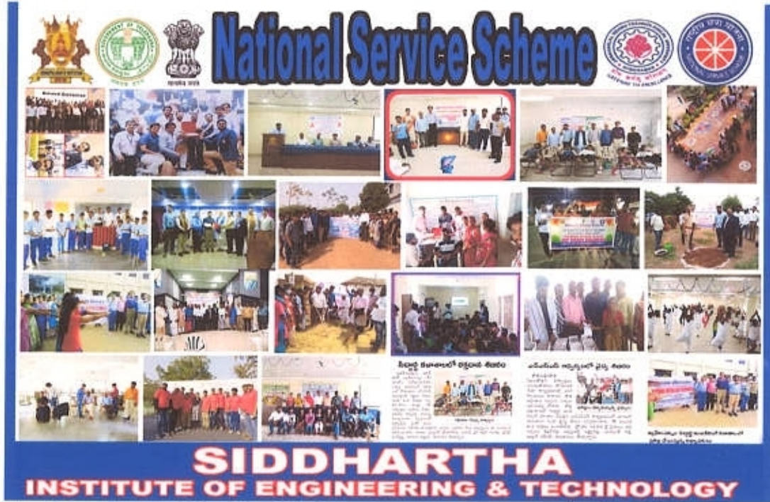
Blood Donation and Free Eye Check-up Programs, etc., organized by Siddhartha Institutions.