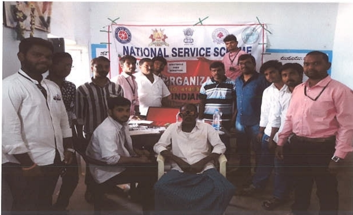
Free Eye Check-up Program Organized by SIET NSS Team

PRINCIPAL SIDDHARTHA Institute of Engineering & Technology Vinobha Nagar (V), Ibrahimpatnam (M), Ranga Reddy District-501 506.