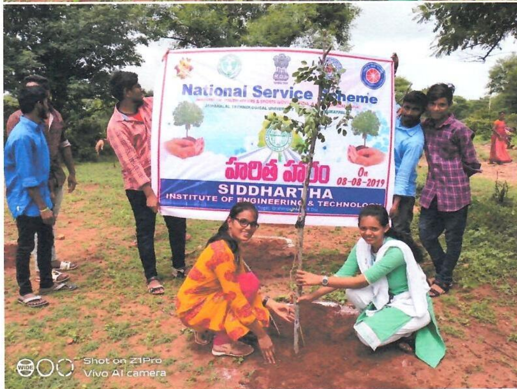
Haritha Haram program conducted by SIET students