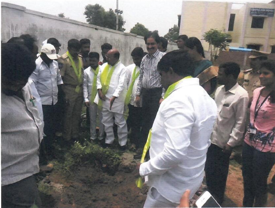
Haritha Haram program organized by SIET

7.1.6: Quality audits on environment and energy are regularly undertaken by the Institution and any awards received for such green campus initiatives Beyond the campus environmental promotional activities