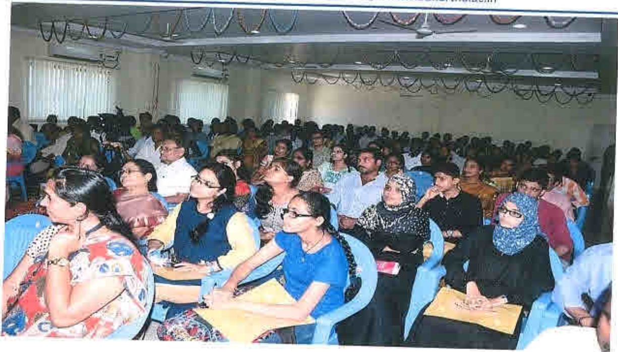
Parents & Students Participation in "Orientation Programme 2021-22" at SIET