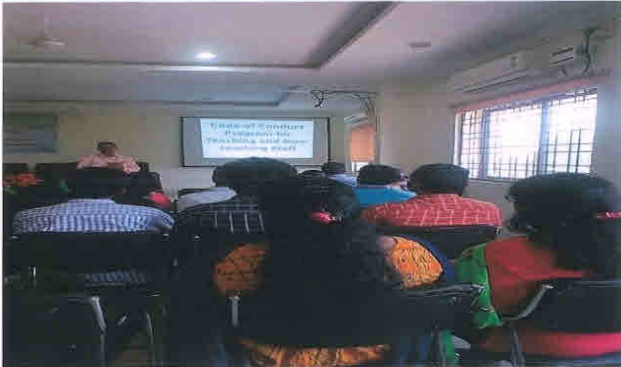
Annual Awareness Program-1 on "Code of Conduct and Professional Ethics" for the Year 2020-2021