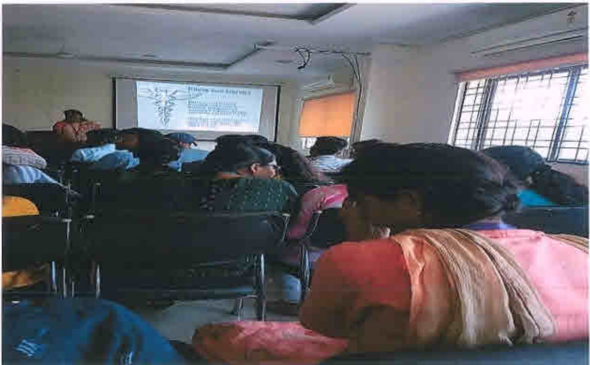
Annual Awareness Program-2 on "Code of Conduct and Professional Ethics" for the year 2021-2022