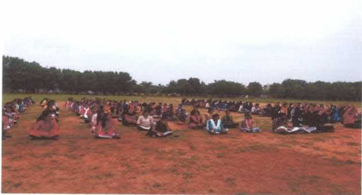
Yoga performed by students in SIET campus