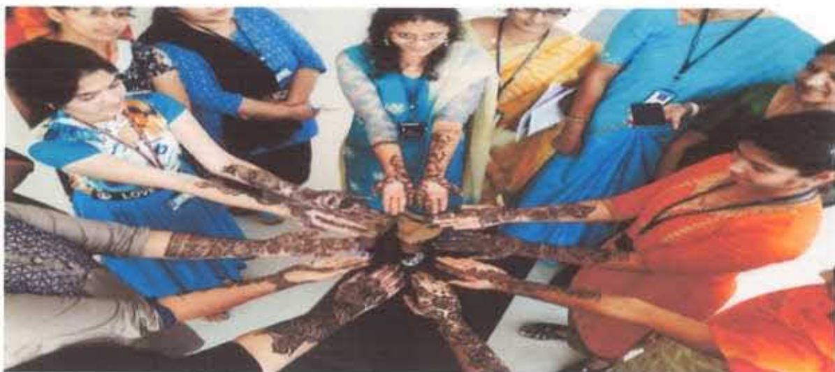
Mehendi celebrations by the girl students.