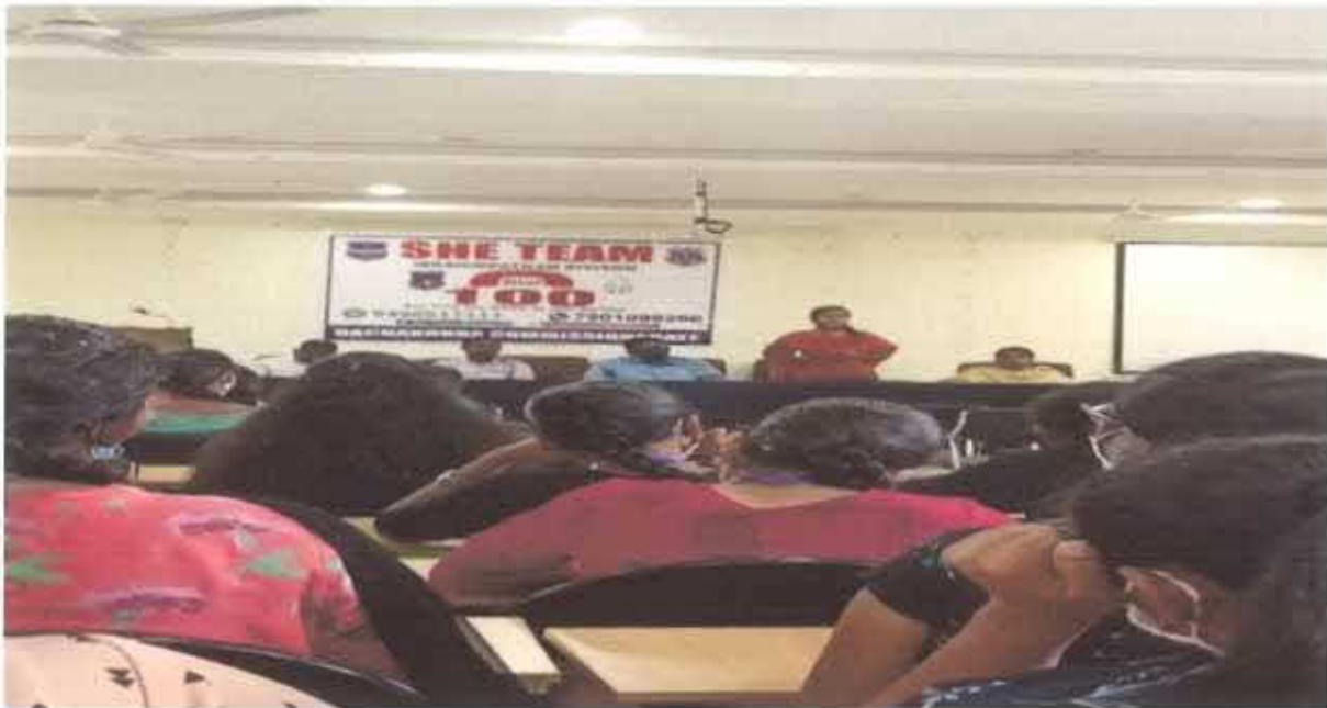
She Team organized at SIET (She Team) member addressed the gathering for girl students.

“SHE TEAM” has conducted sessions for the student of SIET to bring awareness among them and has highlighted the need for self-defense in girls.