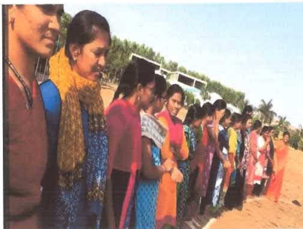
Faculty Sports Day Celebrated at SIET for ACY2016-2017

SIET encourages its women faculty and the girl students to take up sports by emphasizing on the fact that, the sports are an integral part of life and its importance for one's physical well being and it conducts common sports to remove the barrier between the genders.