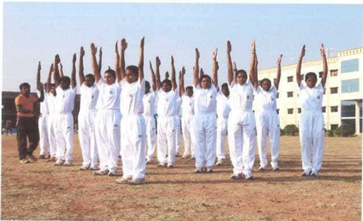
Yoga performed by girl students in SIET campus

Principal PRINCIPAL SIDDHARTHA Institute of Engineering & Technology Vinobha Nagar (V), Ibrahimpatnam (M), Ranga Reddy District-501 506.