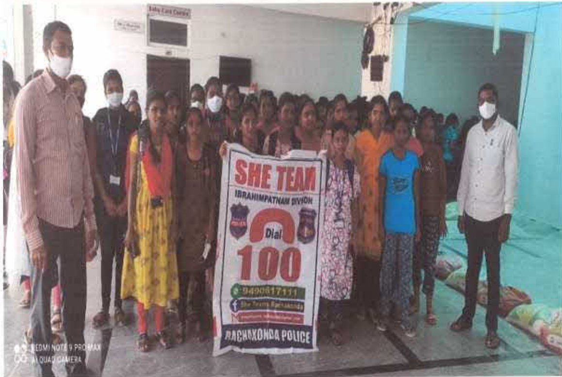
She Team programme was organized to girl students at SIET