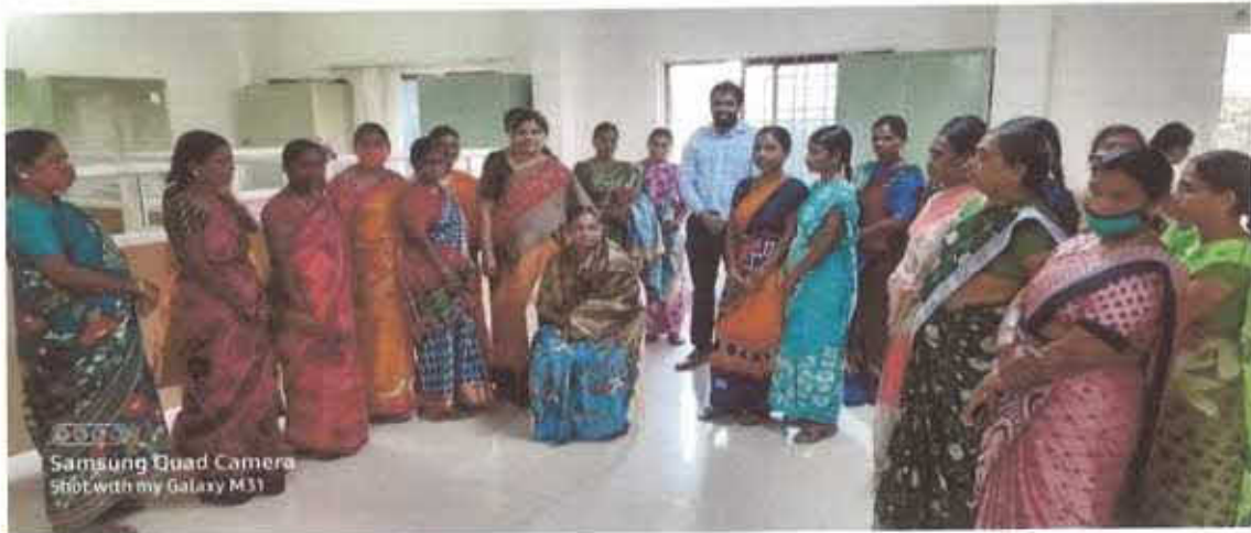
Women's Day Celebrations on 08/03/2020.

SIET celebrates International Women's day to empower Women with motivational talk on self confidence, decision making, and their right to influence social changes for themselves and others.