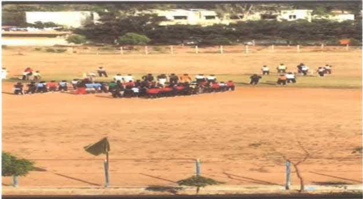
SIET conducted Sports for the faculty for the academic year 2017-2018