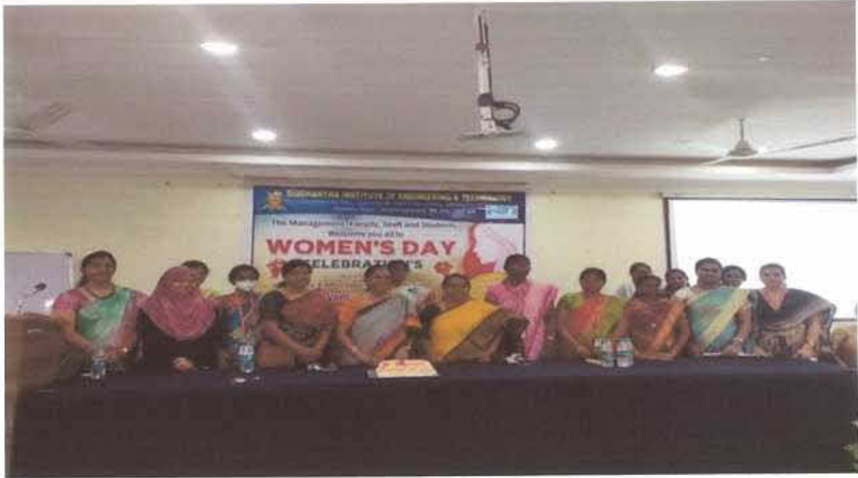
Women's Day celebrations with Management, Staff and Students at SIET