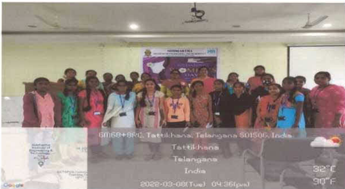
Group photo with Chief Guest on International Women's Day

PRINCIPAL SIDDHARTHA Institute of Engineering & Technology Vinobha Nagar (V), Ibrahimpatnam (M), Ranga Reddy District-501 506.