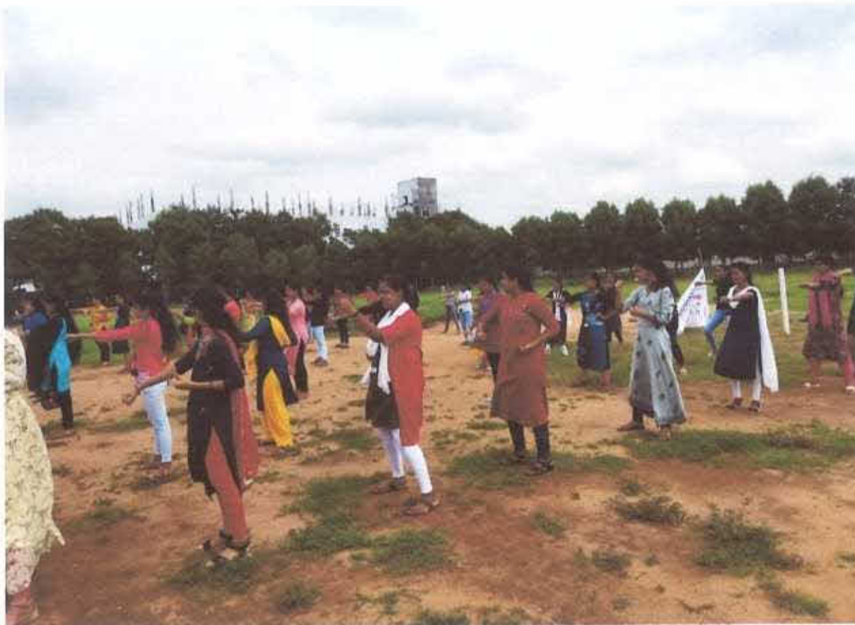
Self-Defence and karate training programme to train girl students for self defence organized at SIET.

Self-defense is an art of overcoming one's fears and turning them to strengthen themselves to enable one to be confident about one's physical and mental ability to defend themselves in dire consequences. To attain this, every year SIET is conducting Karate workshops for its students.