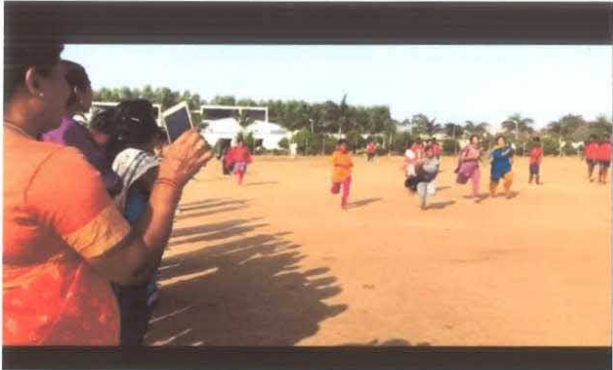
Running race for faculty at SIET