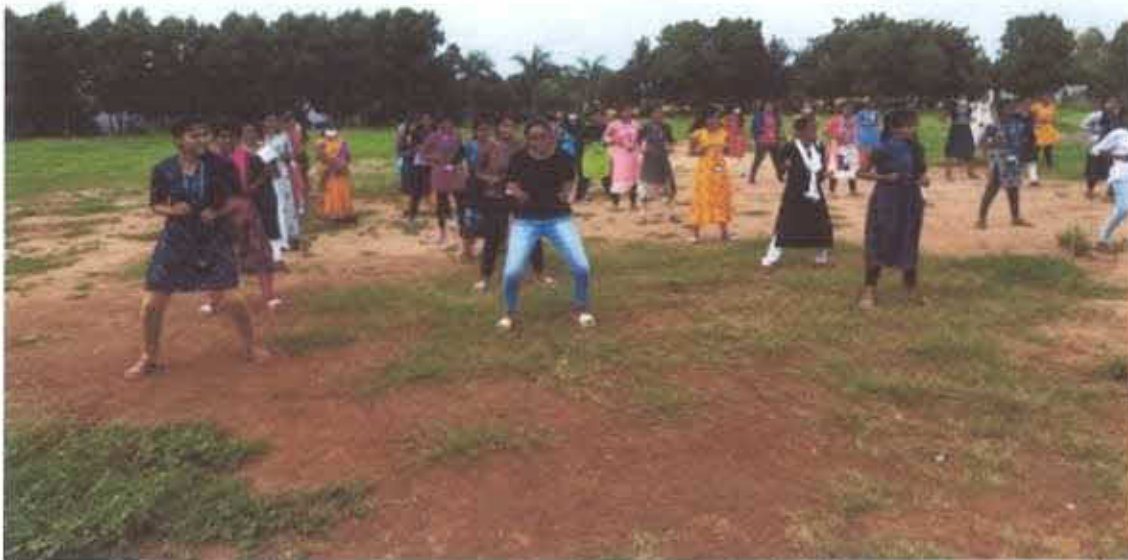
self defence and karate Programme performed by the girl students