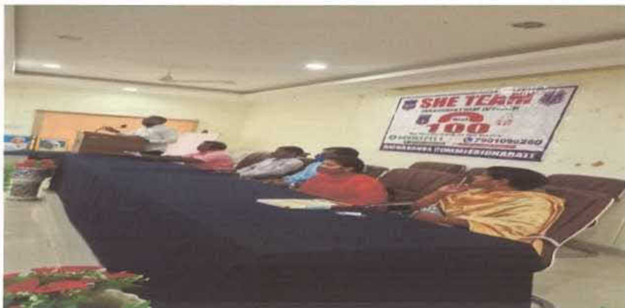
She Team S.I addressed the girl students to mould themselves in all aspects in their life.