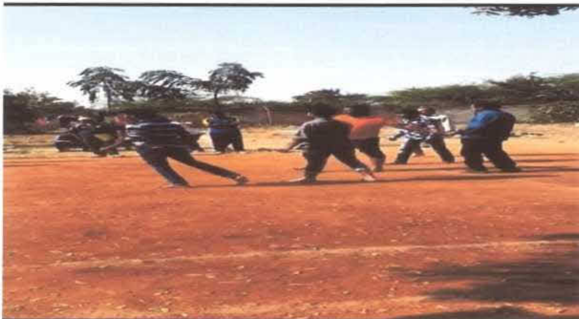
Faculty playing Kabaddi game at SIET for the Academic Year 2020-2021