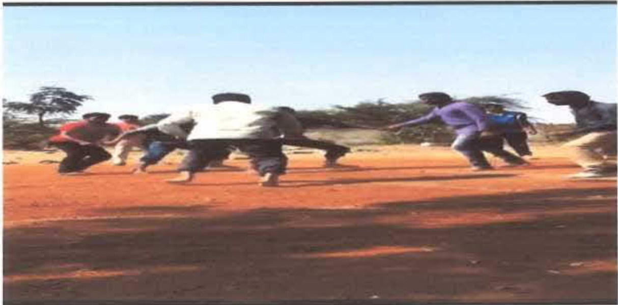
SIET organized sports (kabbadi )for faculty 2018-2019