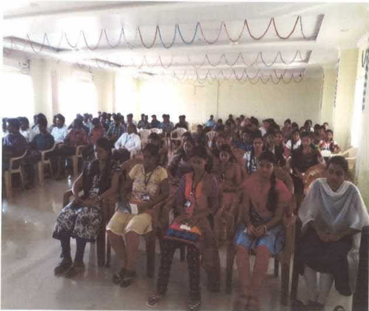
Yoga day (Through the practices of yoga, we discover that concern for the happiness) performed by the students at SIET 2019-2020

Yoga sessions at SIET are organized by the Peace of Society: Guardian of the Mind, Body and Spirit.